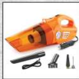
TI-8 3-in-1 Vacuum Cleaner & Tyre Inflator