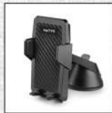
MH-2 Mobile Holder