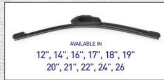
AVAILABLE IN 12", 14", 16", 17", 18", 19" 20", 21", 22", 24", 26