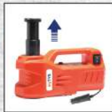
TJ-65 Electric 3-Ton Car Jack