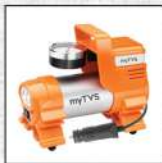
TI-4 Heavy Duty Car Tyre Inflator