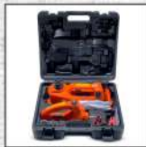
TI-6 5-in-1 kit with Electronic Jack (3 Ton) & Wrench