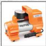
TI-86 Digital Heavy Duty Car Tyre Inflator