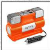
myTVS TI-18 X-Series Air Thunder Tyre Inflator Double Cylinder 150Psi