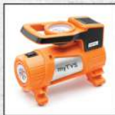
TI-7 Heavy Jet Car Tyre Inflator