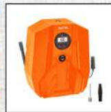
TI-16 Airchamp Digital Auto Stop Car Tyre Inflator