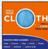
MC-1 Microfiber Cloth